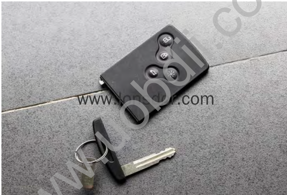
For Keleos smart key, the induction key slot lies in front of the gear: